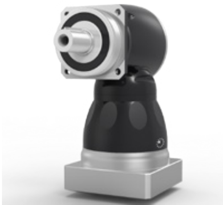
KF S1 / S2